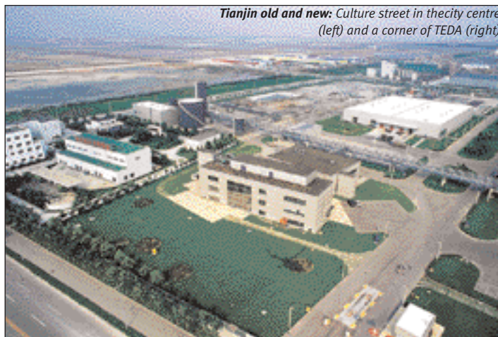
Tianjin old and new: Culture street in the city centre (left) and a corner of TEDA (right)

● For further information, see www.teda.gov.cn and www.investteda.net