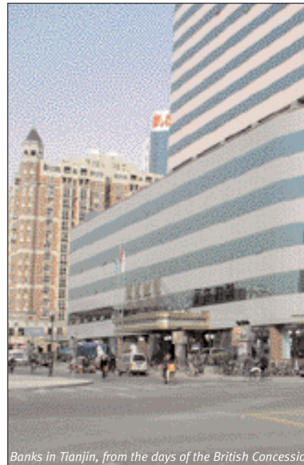
Banks in Tianjin, from the days of the British Concessions