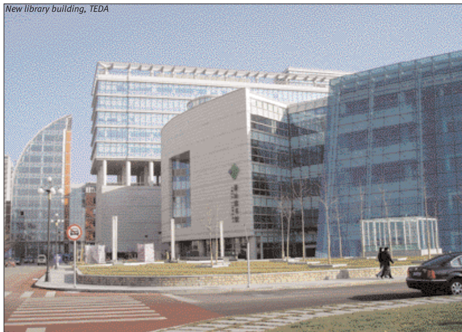
New library building, TEDA

TEDA, which has been in existence for 20 years, consistently comes top of the economic and technology zones.