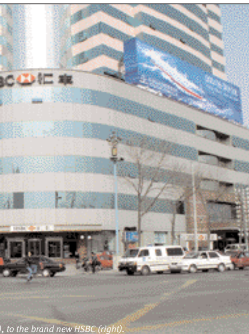
, to the brand new HSBC (right).